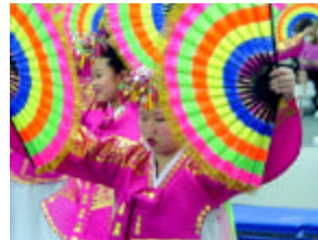
Chonsa Korean Dancers at the Korean Culture Show